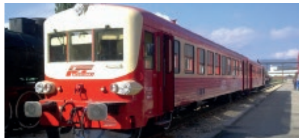
DMU X4500 Caravelle