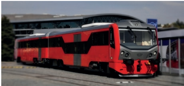
DMU 814 „Regionova”