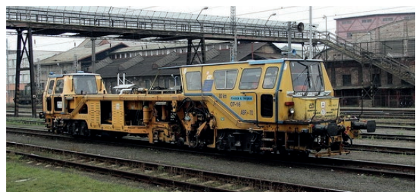
Special rail work vehicle