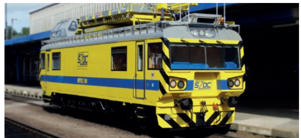
Special rail vehicle MDTV2.2.