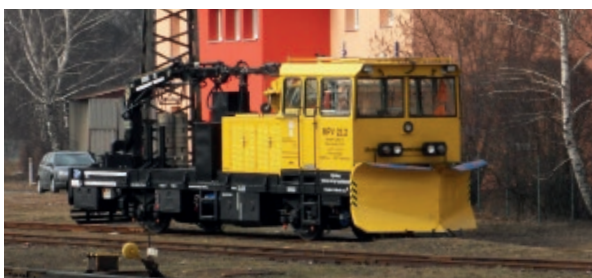
Rail draisine MPV 22