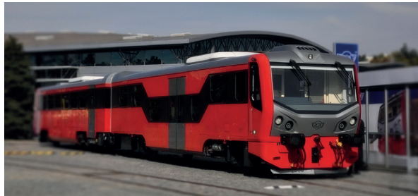
DMU 814 „Regionova“