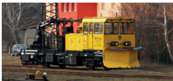
Rail draisine MPV 22