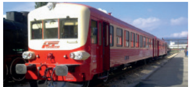
DMU X4500 Caravelle