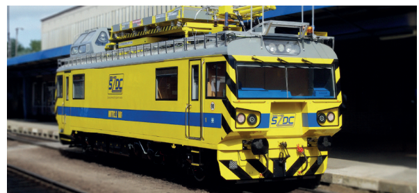
Special rail vehicle MVT2.2.